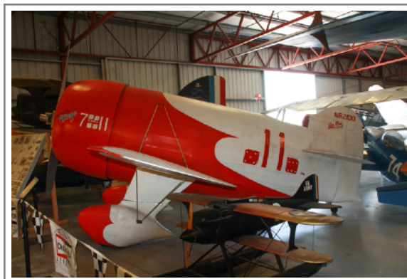
NR2100 Granville Gee Bee D Sportster Replica 19 September 2012 Planes of Fame Chino