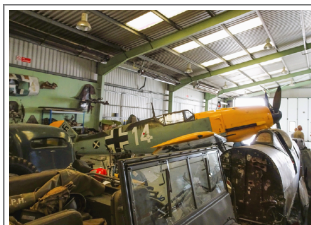
G-CIPB Messerschmitt BF.109E 24 June 2022 Biggin Hill