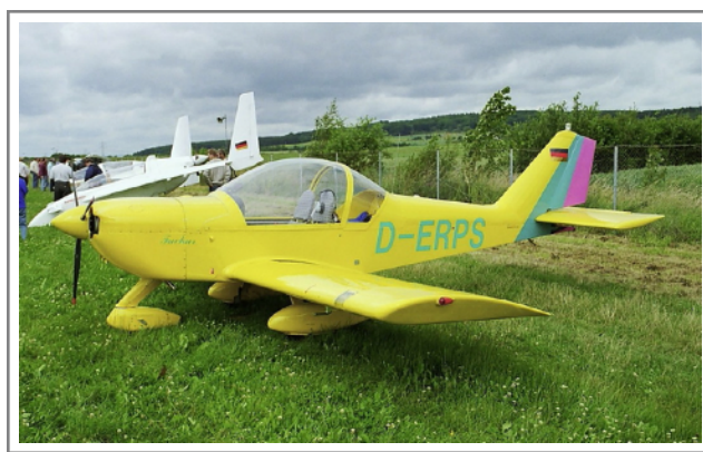
D-ERPS Pottier P.220S Koala 28 June 1997 Koblenz