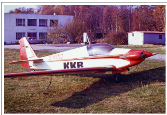
D-KINO Alpavia built Fournier RF-3 3 November 1973 Borkenberg