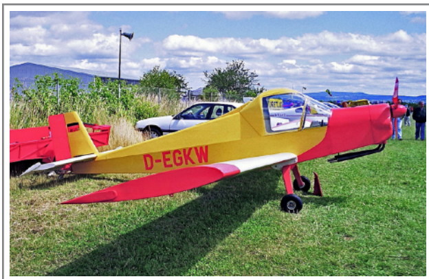
D-EGKW Klinker K.1 28 June 1997 Koblenz