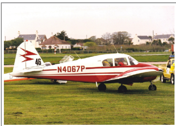
N4067P Piper PA.23-160 Apache 3 May 1996 Jersey