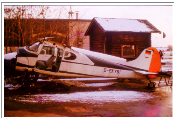
D-EKYB Cessna 170B (wreck) 19 December 1973 Egelsbach