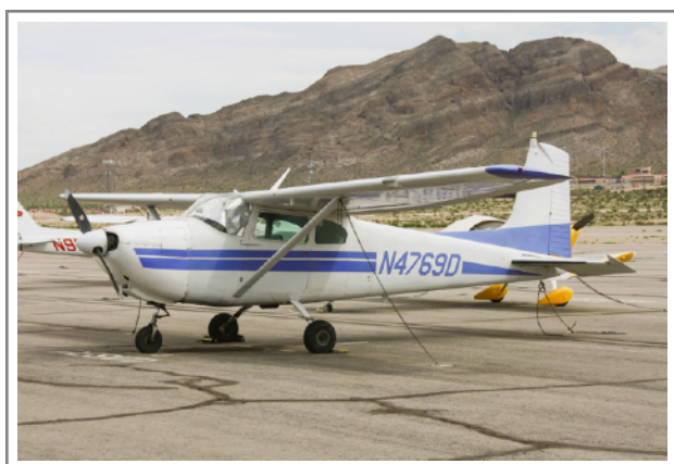
N4769D Cessna 182A September 2012 Jean Navada