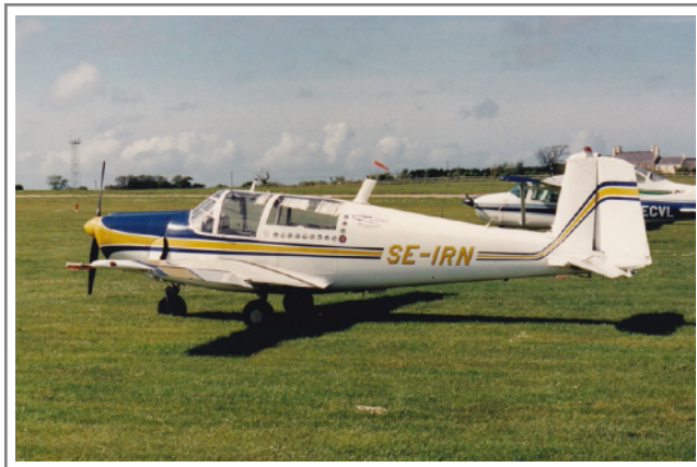
SE-IRN SAAB 91D Safir 31 May 1997 Jersey