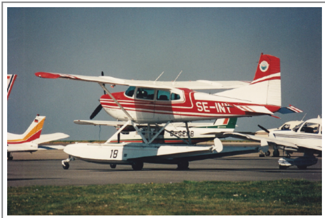
SE-INY Cessna A.185E Skywagon Floatplane 2 May 1997 Jersey