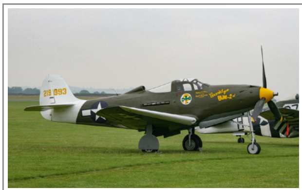
G-CEJU 219993 Bell P-39Q-6 Airacobra 14 October 2007 Duxford