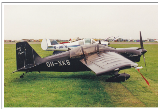
OH-XKS Rans S.10 Sakota 4 July 1997 at Cranfield