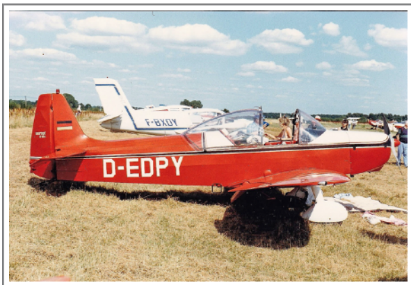
D-EDPY Binder CP.301S Smaragd 30 July 1988 Moulins