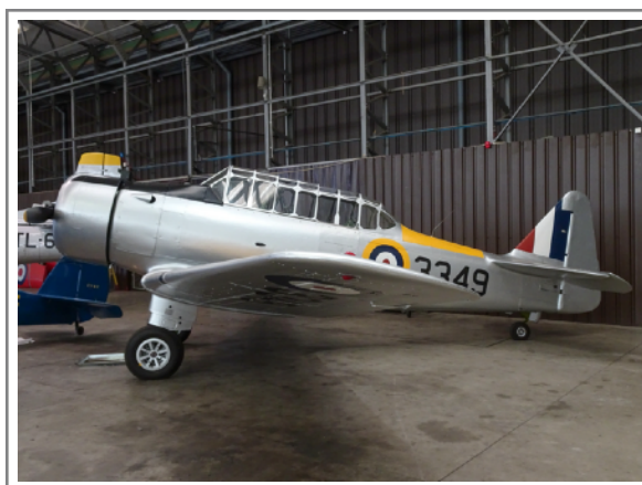
G-BYNF 3349 N.A.64 Yale I 10 June 2017 Duxford