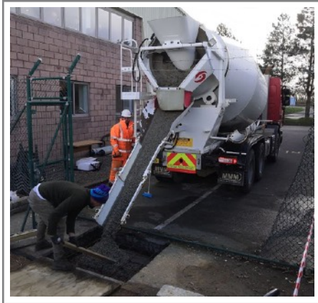
Foundation pads being poured

On 19 th December the foundation pads were poured for the new balcony extension. The Committee hired labour directly to dig the holes & pre-build the steel cages. In addition the Club purchased the reinforcement and concrete at trade prices to keep costs as low as possible. We will have a more detailed update on the balcony along with the planned dates for installation in the next newsletter.