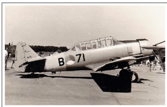
B-71 Noorduyn built N.A.AT-16 Harvard IIB 13 June 1973 at Deelen AFB Holland