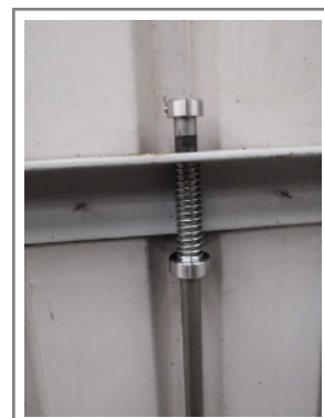
New sprung bottom rollers installed last week