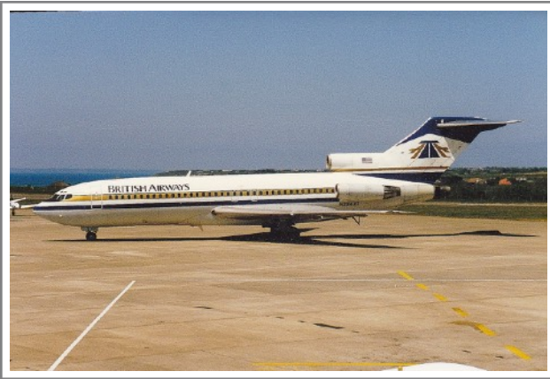
N284AT Boeing 727-22 on 5 June 1988 Jersey.jpg