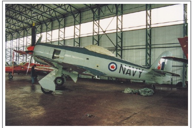
N232J Hawker Sea Fury FB.11 13 October 1991 at North Weald