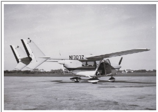
N1707Z Cessna 336 Skymaster. 1964 Jersey