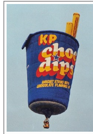
G-DIPI Cameron 80SS Tub January 1989 Marsh Benham.jpg