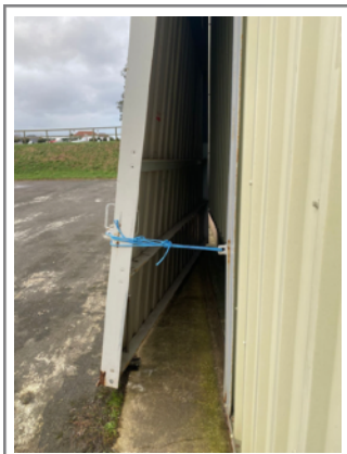
Hangar Door dislodged after the storm

Storm Darragh caused a few issues with the Hangar Doors. One of the original (unmodified) doors on CIASL jammed shut as the continual vibration caused by the wind unwound one of the top bolts. The jammed doors then trapped all of the aircraft inside until the winds had abated sufficiently to allow the door contractors to get access to the bolts. On the members Hangar we had the opposite problem. The modified doors now run so easily they blew open in the wind after which air pressure behind one door then caused it to dislodge. Although it looked rather dramatic, the door was easily clipped back on the rail. Since the storm we have now fitted the springs which will keep the bottom rollers in place no matter how adverse the winds are. We will also fit large external shoot bolts at the end of each run to stop them blowing open. These will be deployed to keep the doors shut every time the wind exceeds Force 9.