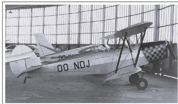
OO-NDJ SNCAN built Stampe SV.4C 29 September 1973 Grimbergen