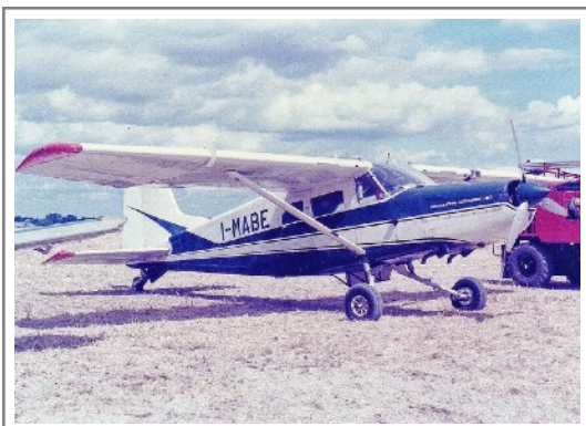
I-MABE Aer Macchi Lockheed Lasa 60 26 July 1986 Brienne Le Chateau