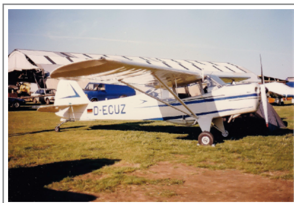
D-ECUZ Auster 5 3 July 1987 Cranfield_