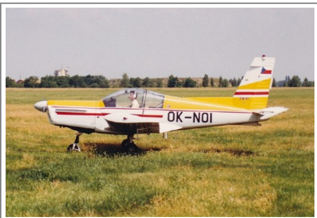
OK-NOI Zlin Z.142 20 June 1992 Letany