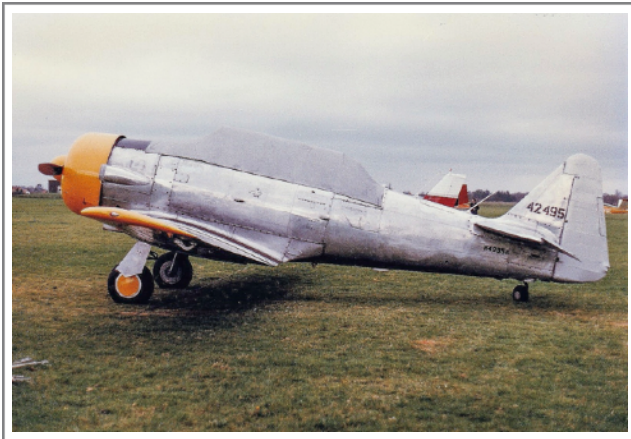
N4995A N.A.AT-6C Harvard IIA 23 April 1990 White Waltham