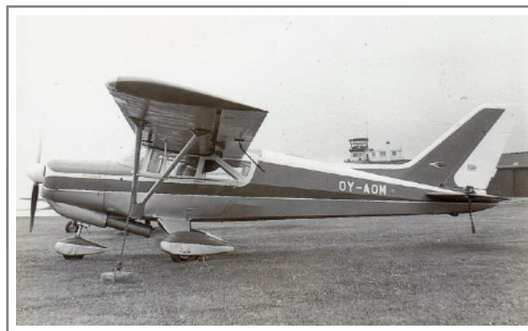
OY-AOM Beagle A.109 Airdale 5 May 1967 Jersey