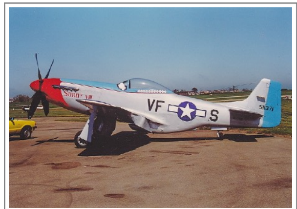
N1051S 511371 N.A.P-51D Mustang Jersey