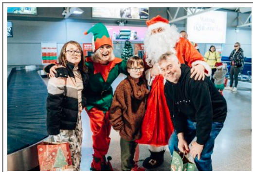
Every child received a present from Santa