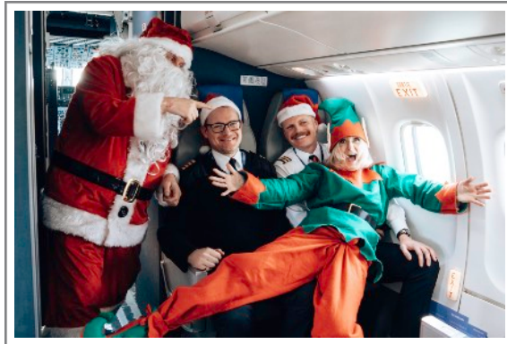
What a team ... !